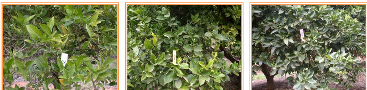
Fig 2: Valencia orange trees at Loxton Research Centre, October 2007. Left to right; Untreated control, Grape Marc 200 \text{ m}^3\text{ha}^{-1} , Compost 200 \text{ m}^3\text{ha}^{-1} .